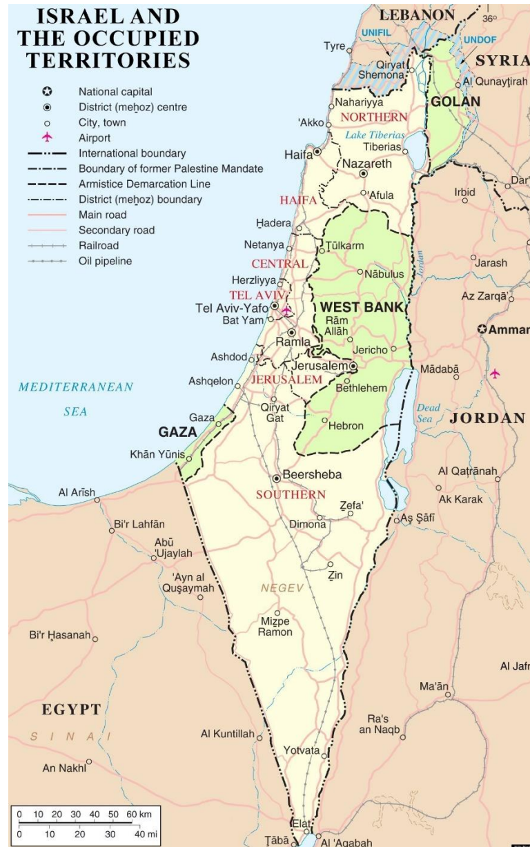
Figure 3: Map of Israel and the Palestinian Territories according to the 1967 Border

after the Jewish holiday that was celebrated on the day of the outbreak; Council on Foreign Relations, 2017)) in an attempt to regain some of the occupied territory (Heller, 2010).