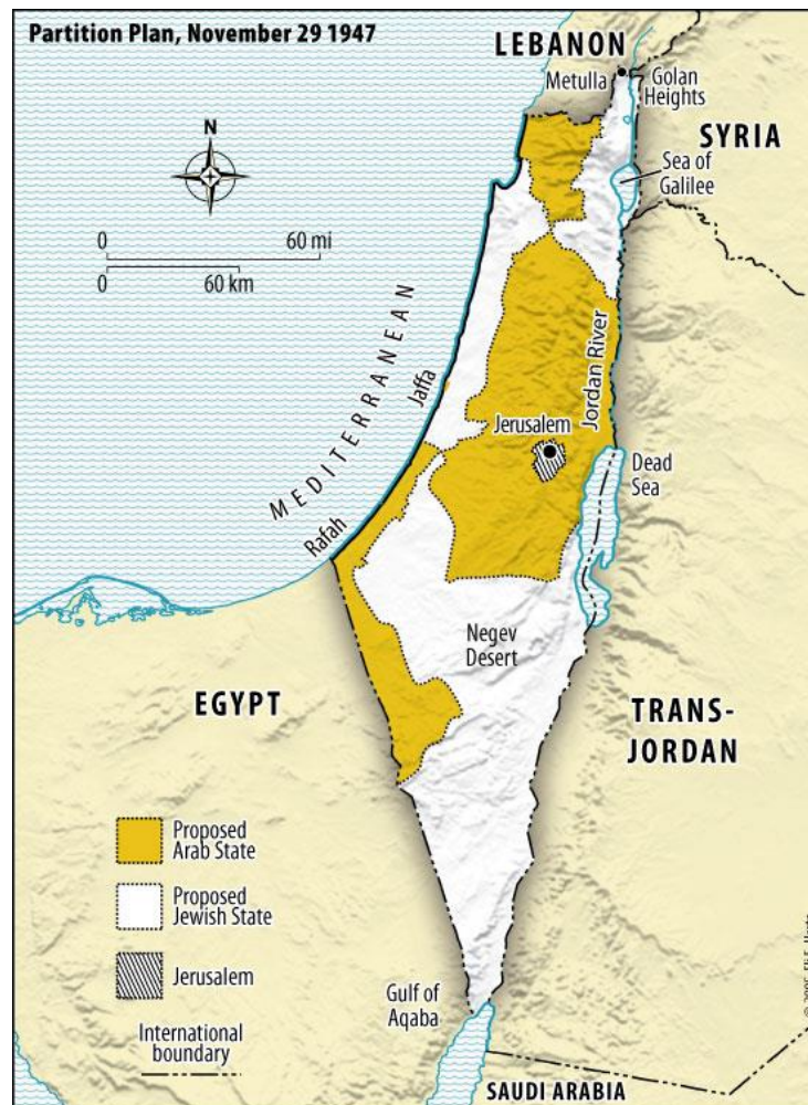
Figure 2: The UN Partition Plan Borders

Palestinian refugees (United Nations Department of Public Information, 2003). This is often referred to as the Nakba (catastrophe) from the Palestinian or Arab narrative and is still commemorated today (Al Jazeera, 2017).