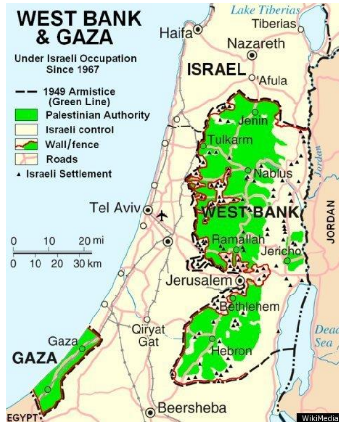
Figure 4: Current Breakdown of Authority in the Israel/Palestine Region